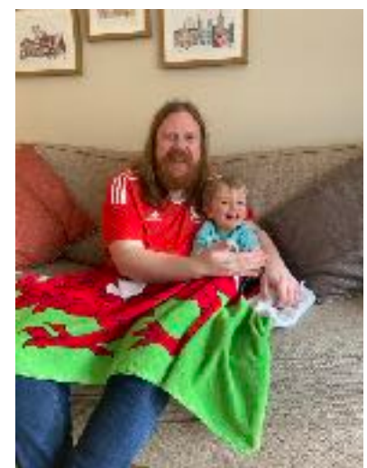
Football and Wales.