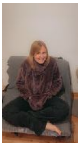
Cosy and comfy.

Our staff, dressing to express. Send our photos in by email to sec.westfield@halton.gov.uk