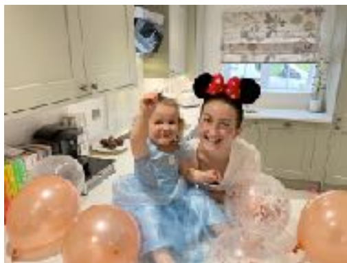
Disney, princess, glitter and balloons.

The theme for this year is 'Dress to Express' and I am inviting you to email a photo of your child/ren wearing something that tells me about them. For example, sporty, bright colours or cosy and comfy like me!