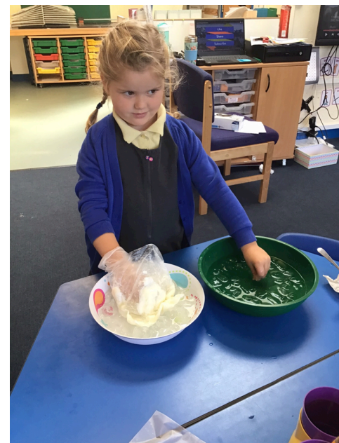
Year 2 Geography lesson about penguins and how they keep warm in a cold climate.

24th - 26th November Robinwood residential for Year 6